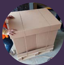
Strong & Robust

Paper Strapping is a completely recyclable alternative to polypropylene plastic strapping and has been designed to be used in automatic or semi-automatic production operations.