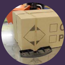
Semi-Auto Machine Compatible